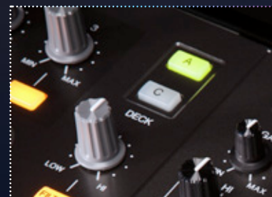
Four-channel deck control Intuitive four-channel mixing for the ultimate in flexibility.

The DDJ-T1 delivers the clear, powerful sound the industry has come to expect from Pioneer. Optimised audio circuitry in the master output area ensures high-quality sound that has beaten the competition hands down in listening tests. Plus, audio characteristics optimal for TRAKTOR have also been included to really make this a match made in heaven.