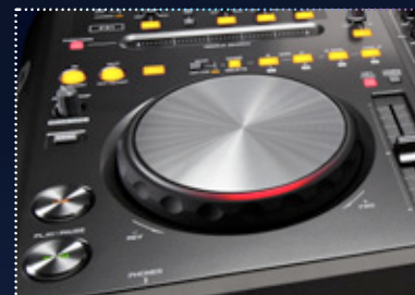
Club standard layout Features borrowed from Pioneer's pro DJ range ensure a smooth transition from home to club, including the 115mm jog wheel.