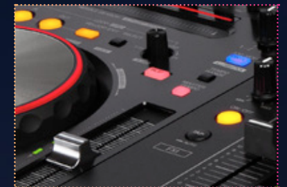
Advanced Pioneer features Including the popular slip mode for looping, reversing and scratching without changing the track's tempo.