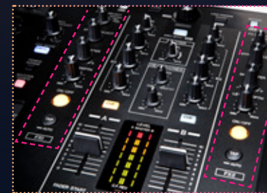
Intelligent effect control area Access Serato Itch's extensive effects suite from the controller.

Optimised audio circuitry in the master output area is taken from our pro DJ equipment and combined with audio characteristics designed specifically for Serato ITCH. The result is superior sound quality that makes the DDJ-S1 a force to be reckoned with.