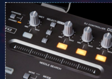
Effect control area Effects area, with six effects, mirrors the TRAKTOR interface for instant familiarity.