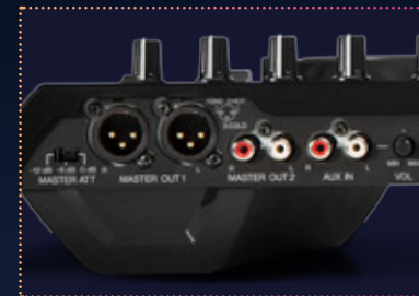
Multiple inputs and outputs Including a balanced XLR input and output for direct connection to a PA system with no loss of sound quality.