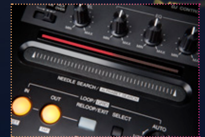
Playing Address feature Clear LED display shows the progression through the track.